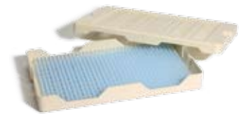
APTIMAX® Instrument Trays & Mats