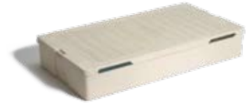
APTIMAX® Instrument Tray

* Not designed to fit in STERRAD® NX™ Systems